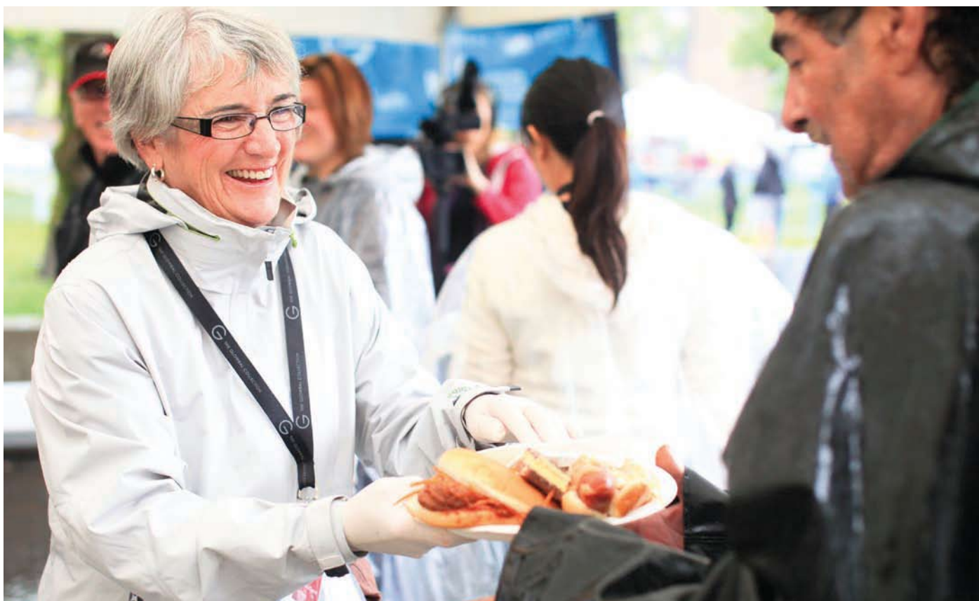
A Glowbal volunteer distributes one of the more than 6,300 meals served at Oppenheimer Park.