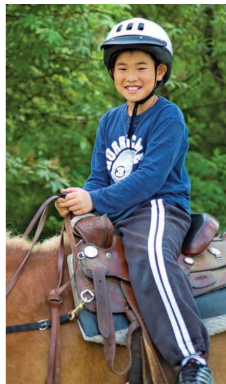
A young camper goes horseback riding.

The experiences you provided have been so profoundly felt and appreciated that UGM is still getting notes of thanks from the kids and their parents who enjoyed the opportunity you provided through the simple, yet transformative, act of sending a child to camp. Thank you!