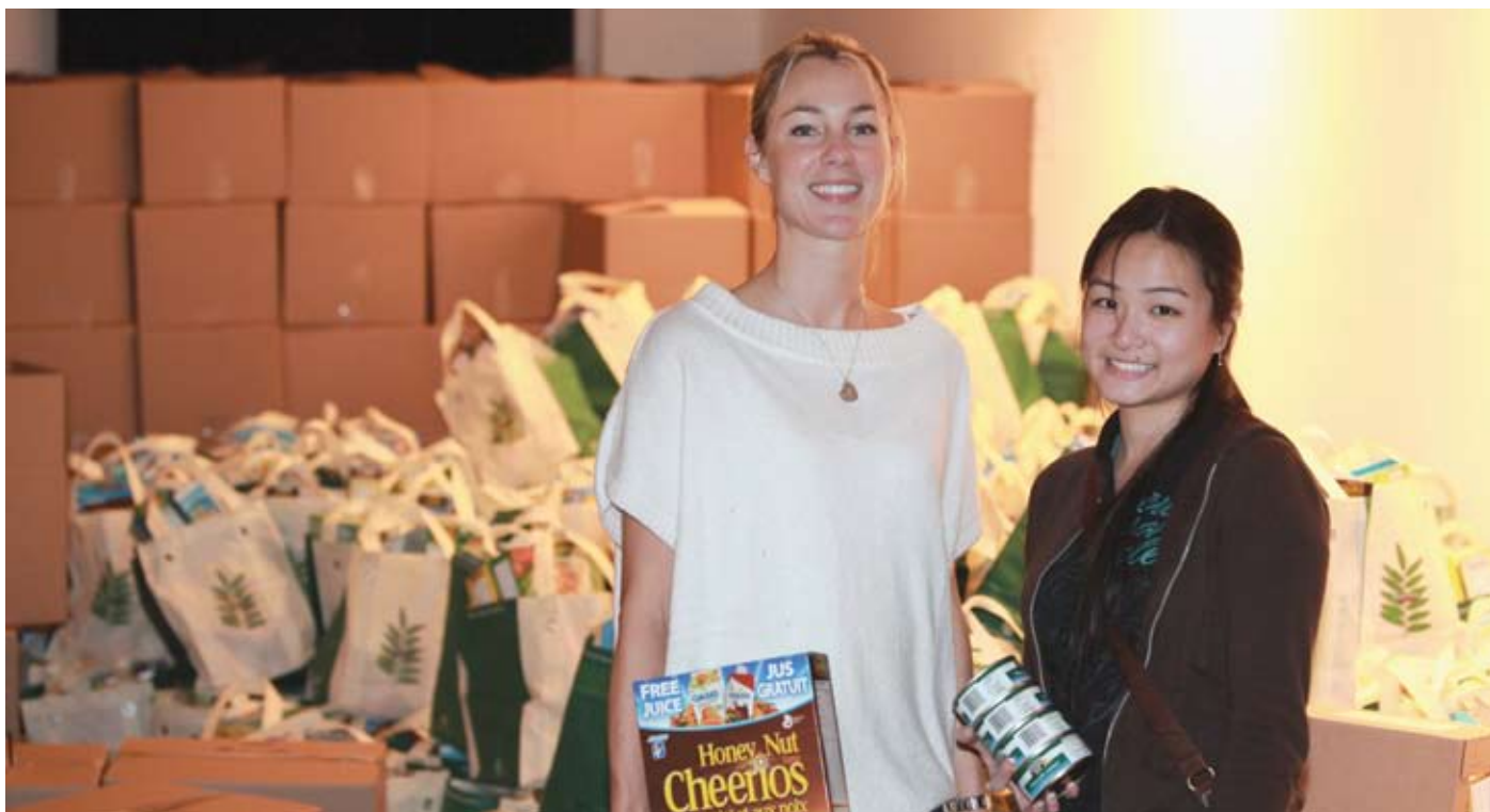
Volunteers take on the incredible task of packing UGM's much appreciated Christmas hampers.