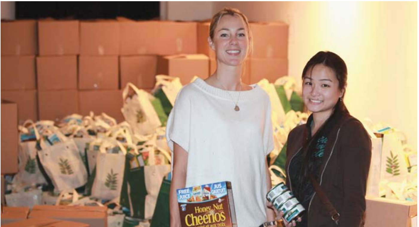
Volunteers take on the incredible task of packing UGM's much appreciated Christmas hampers.